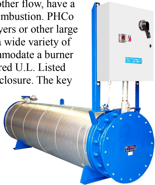
PHCo FPH Model Preheater

PHCo's "Lo-Density" ® electric preheater is the solution if you are looking to save dollars when using the heavier or reclaimed fuel oils. PHCo has developed, through years of research, a system to increase atomization, insure smoother flow, have a more accurate control of temperature and improve combustion. PHCo preheaters are perfect for steam boilers, aggregate dryers or other large burner operations. PHCo preheaters are available in a wide variety of sizes to pinpoint the exact requirements and to accommodate a burner in any climate. All PHCo preheaters include a prewired U.L. Listed Industrial Control Panel housed in a weatherproof enclosure. The key Components include main disconnect, contactors, individual load fusing, control circuit transformer with fusing, indicating solid state temperature controller, solid state high limit and all the necessary wiring for automatic operation. PHCo's system can be powered by any industrial voltage to efficiently heat at a rate of 5-7 watts per square inch, reducing the possibility of coking the heater tubes.