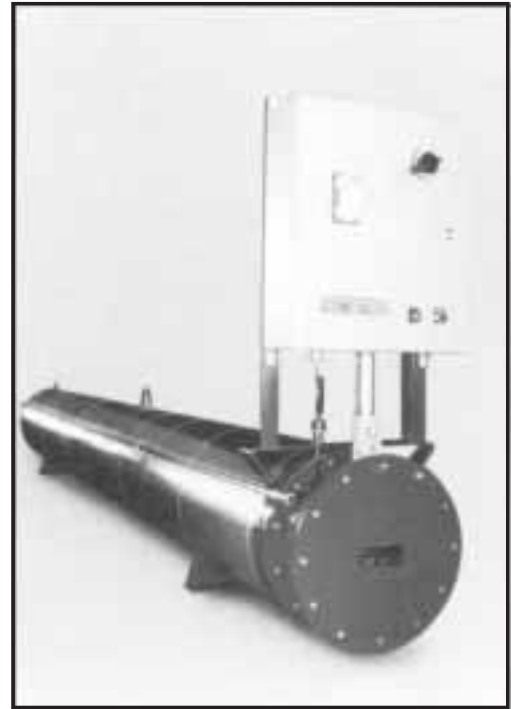
PHCo FPH Model Preheater

All PHCo preheaters include a prewired U.L. Listed Industrial Control Panel housed in a weatherproof enclosure. The key components include circuit breakers, contactors, individual load fusing, control circuit transformer with fusing, microprocessor/controlling thermostat, an overtemperature thermostat and all the necessary wiring for automatic operation. PHCo's system can be powered by any industrial voltage to efficiently heat at a rate of 5-7 watts per square inch, reducing the possibility of coking the heater tubes.