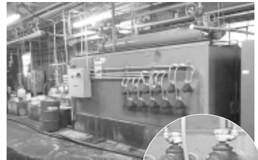
Rigid heaters installed in a paper machine lube oil reservoir.

These heaters can be equally spaced across the base of reservoirs or around tanks for even heat distribution, eliminating hot and cold sections.